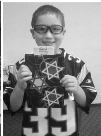
4th Graders show off their siddurs.